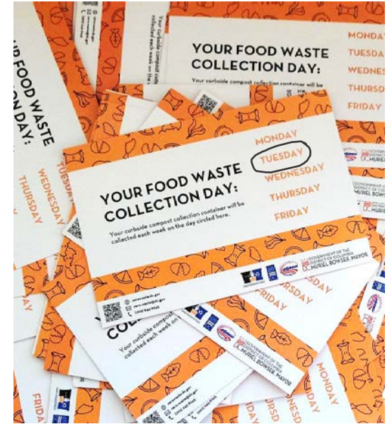
Collection Day Card with information on your household's weekly collection day.

Both collection containers and compostable bags have been tested by DPW in partnership with DC Health for odor and rodent mitigation.