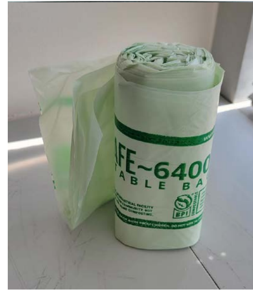
100 Compostable Bags to line your kitchen caddy.