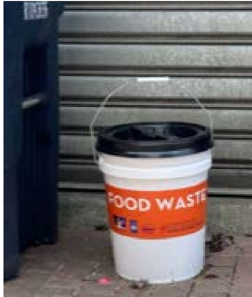
Collection Container for outdoor food waste collection.