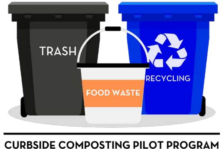
CURBSIDE COMPOSTING PILOT PROGRAM