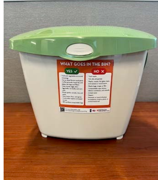
Kitchen Caddy for indoor food waste collection.