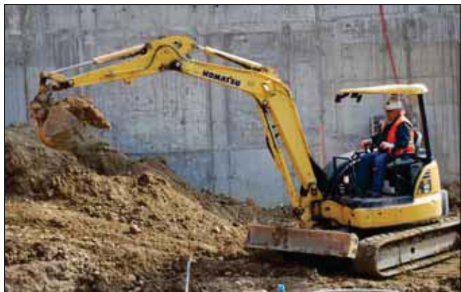
Construction crews are working to improve sewage treatment plants across the Chesapeake Bay region.