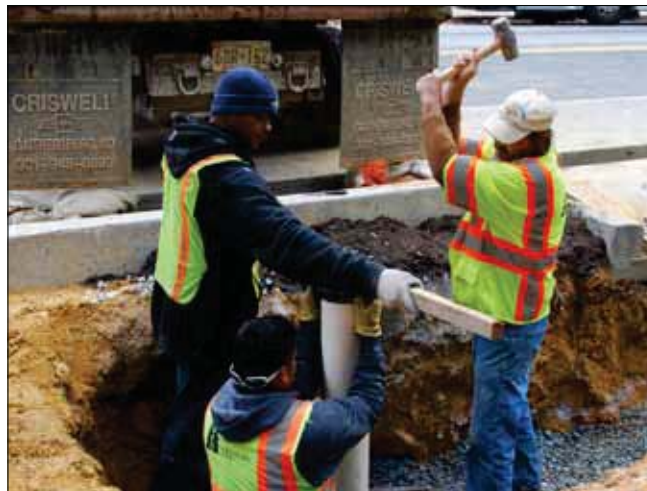
Workers build a stormwater pollution control device called a “bumpout” in Montgomery County, Maryland.

The workers are building a stormwater pollution-control device called a “bump out.” It’s a new technique—a grassy area built by the side of the road, with openings at either end to catch and filter rainwater as it flows down the gutter.