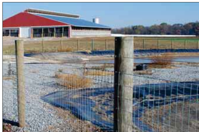
Dairy farmer Leroy Walker built these two manure pits and this new barn to reduce runoff pollution into a nearby stream, which flows toward the Chesapeake Bay.

Walker's construction project included a pair of plastic-lined manure storage pits, a shed to keep rain off his feedlot, and an expanded, state-of-the-art barn with good ventilation and drainage.