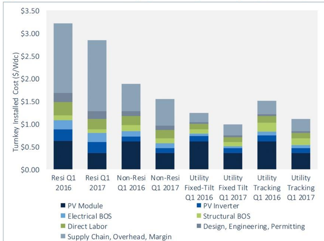
Figure 2.3 Modeled U.S. National Average System Costs by Market Segment, Q1 2016 & Q1 2017

Note: Detailed information about national system prices by market segment and component is available in the full report