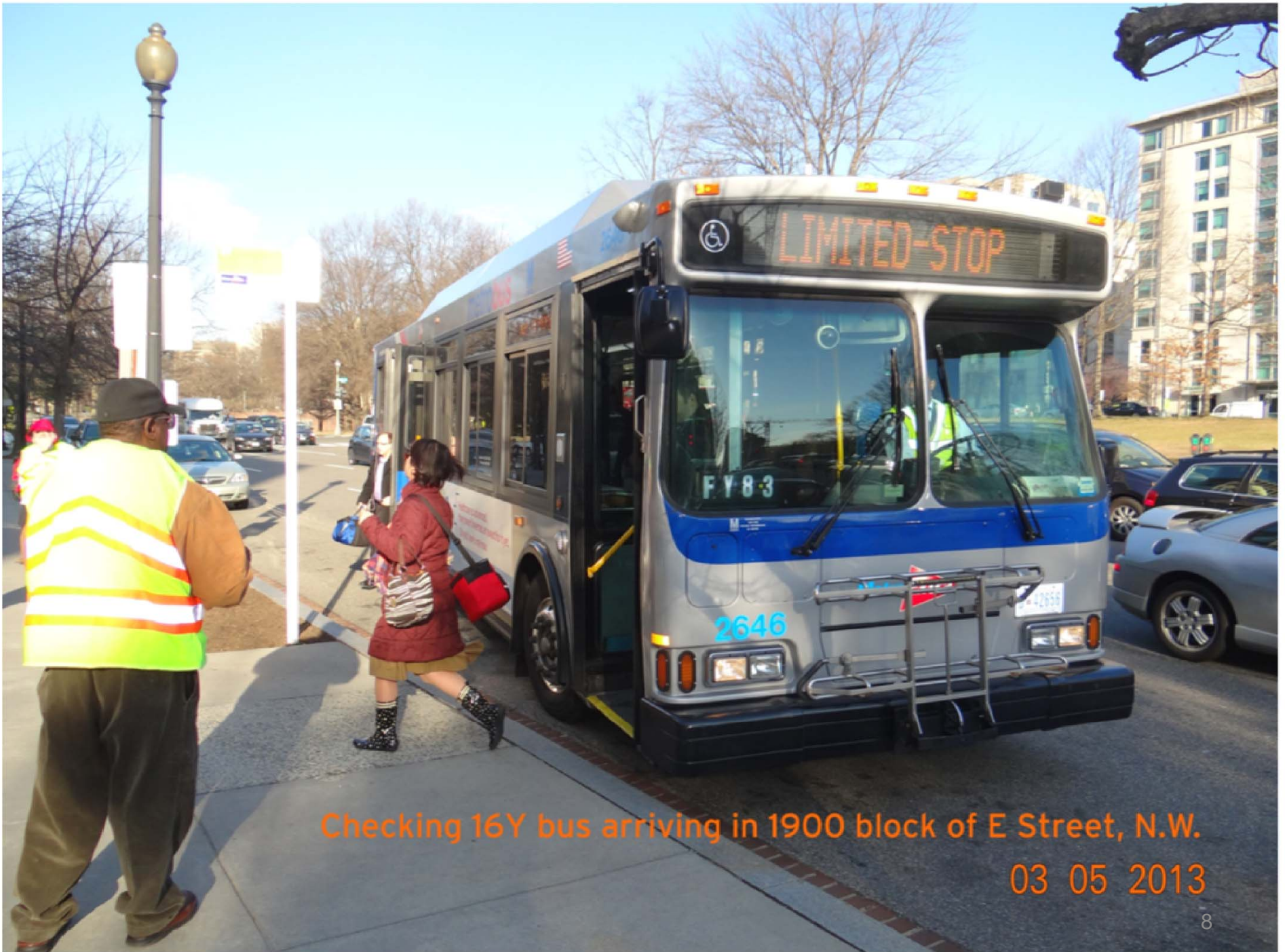
Checking 16Y bus arriving in 1900 block of E Street, N.W.