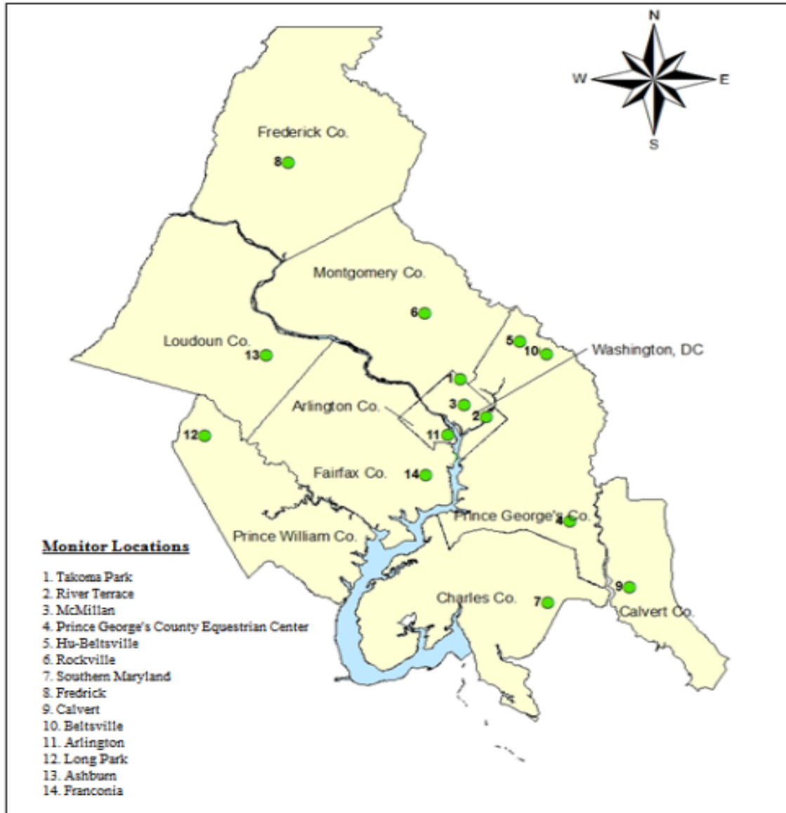
Figure 3-2: Washington DC-MD-VA 2008 Ozone NAAQS Maintenance Area Monitoring Sites

The trends in the ozone design values in Figure 3-3 reflect the effect of the declining emissions trends on ozone levels in the region and further demonstrate that the maintenance area will continue to comply with the 2008 ozone NAAQS in the future.