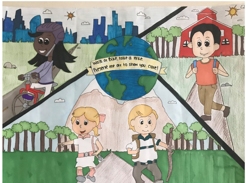
First Place: Claudia Colon-Del Valle