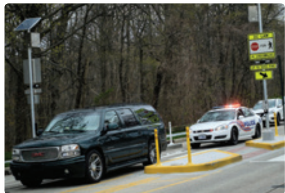
Metropolitan Police Department

Street Smart public awareness efforts are conducted in conjunction with increased law enforcement waves in which police across the region step up enforcement of traffic safety laws that keep pedestrians and bicyclists safe. Fall 2017 enforcement dates were set as November 6 to December 3, and spring 2018 enforcement dates were set as April 16 to May 13. During the fall and spring campaigns, 7,885* citations and 4,182 warnings were issued to motorists, pedestrians, and bicyclists, according to reports from participating agencies in Arlington County, Montgomery County, Prince William County, Prince George's County, City of Alexandria, and the City of Fairfax.