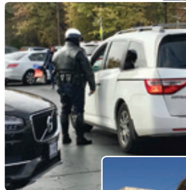
Alexandria Police Department