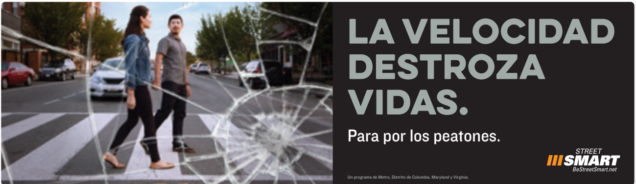
New "Shattered Lives" Series of Advertisements