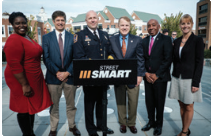
Fall Kickoff Speakers

Speakers at the fall kickoff event included: