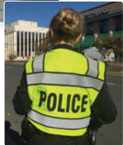
Montgomery County Police Department