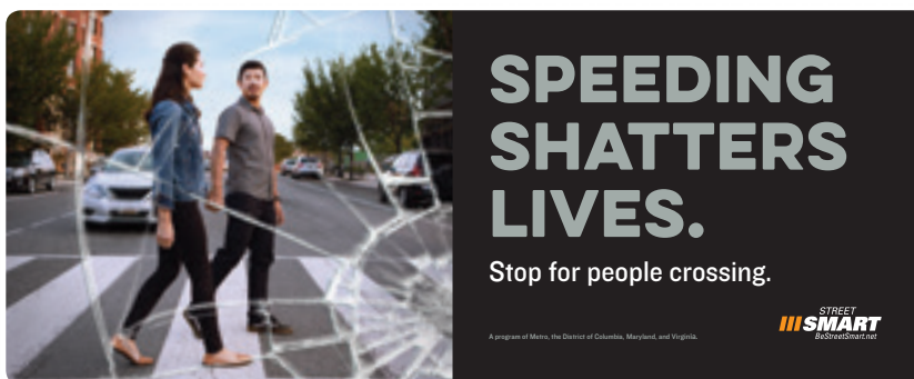
One of four ads presented to measure aided awareness