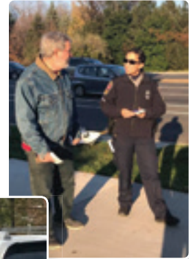
Fairfax County Police Department