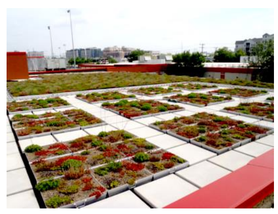
(Above: Green roof in Alexandria, VA)

Several jurisdictions have green building codes or green building policies many of which incorporate green roofs. 41% of jurisdictions have at least one green roof on government property (CEEPC Annual Survey, 2012). Many green roofs have been installed on residential, commercial, and industrial properties throughout the region. No data is available on the prevalence of cool roofs or cool pavements in the region. No jurisdictions or states have cool roof programs or policies that COG is aware of.