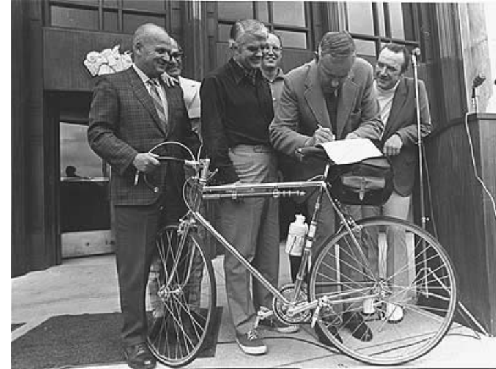
Oregon Governor Tom McCall signs the Bicycle Bill