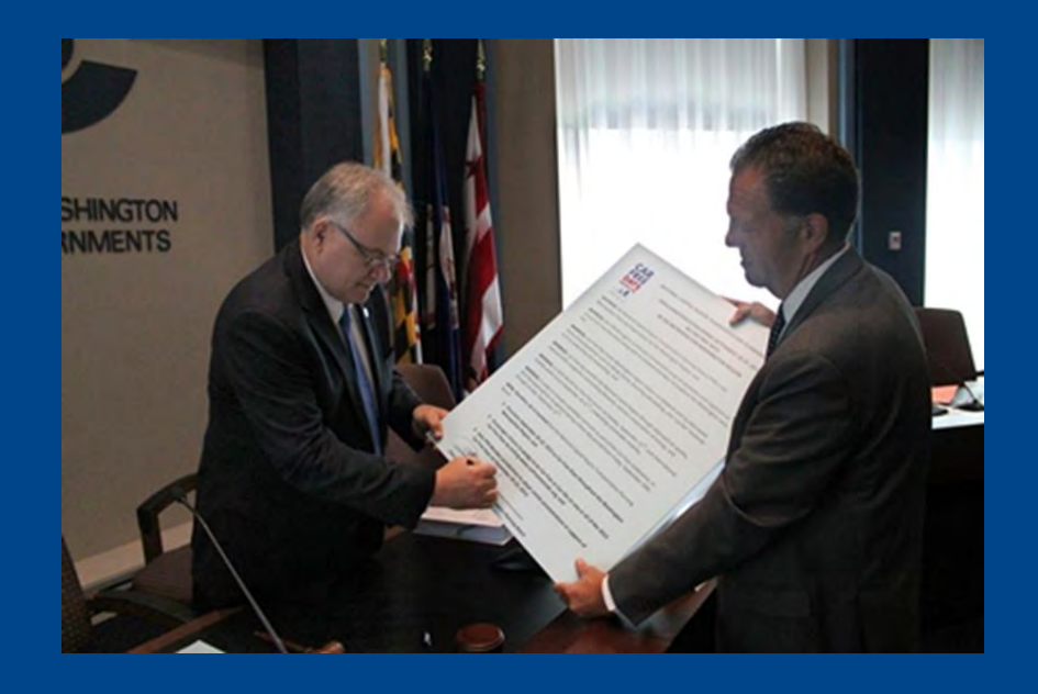
2013 TPB Proclamation Signing