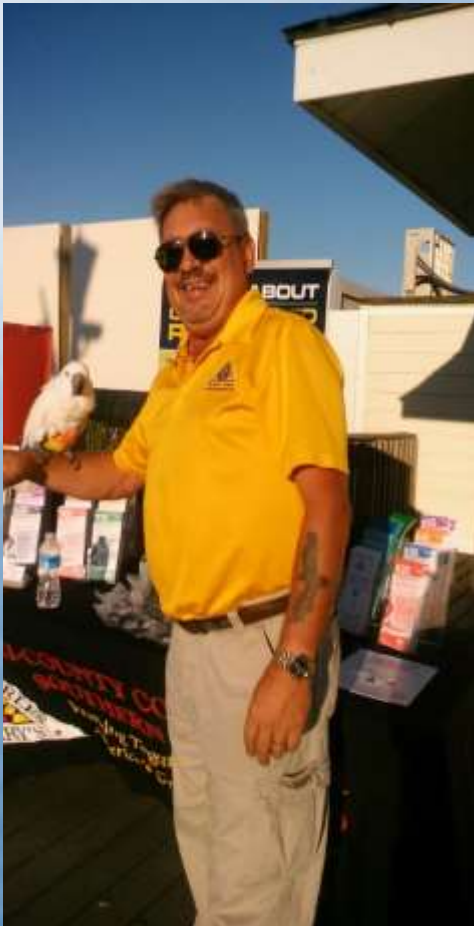
Car Free Day