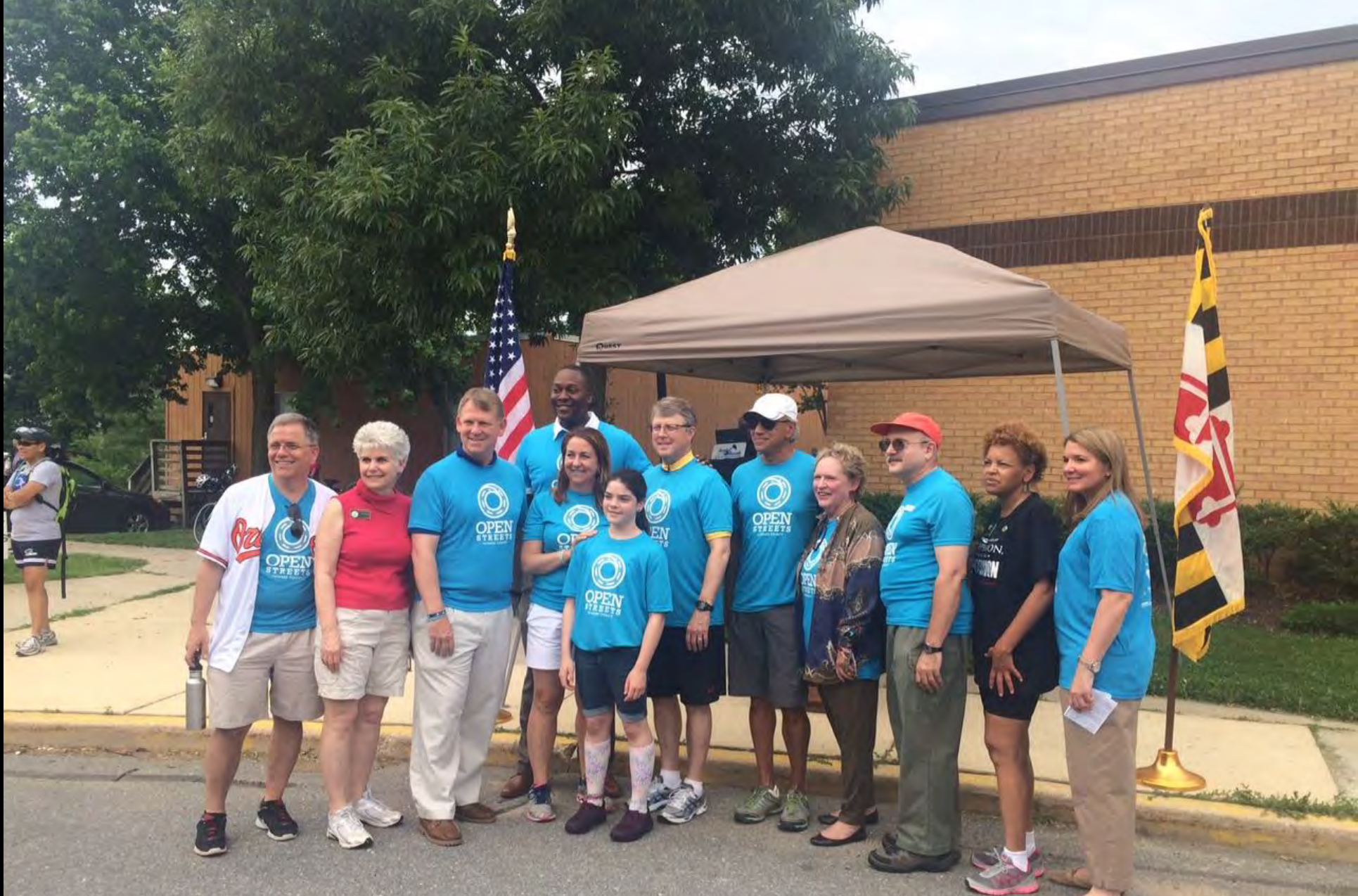
Public Officials & Other Speakers