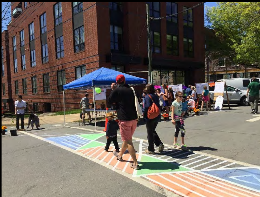
Charlottesville, VA