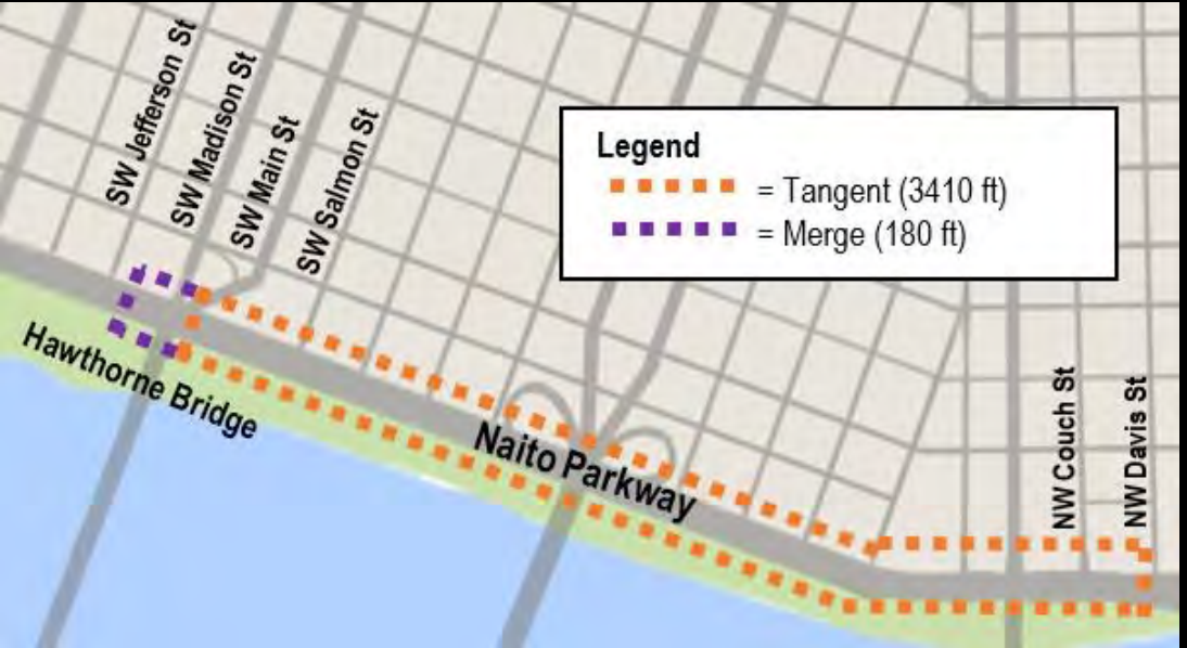
Naito Pkwy - Alt 4, Phase 2