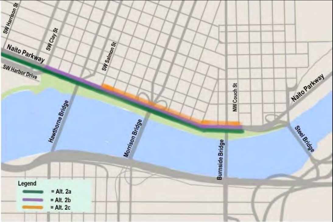
Naito Pkwy - Alternatives 2a, 2b, 2c