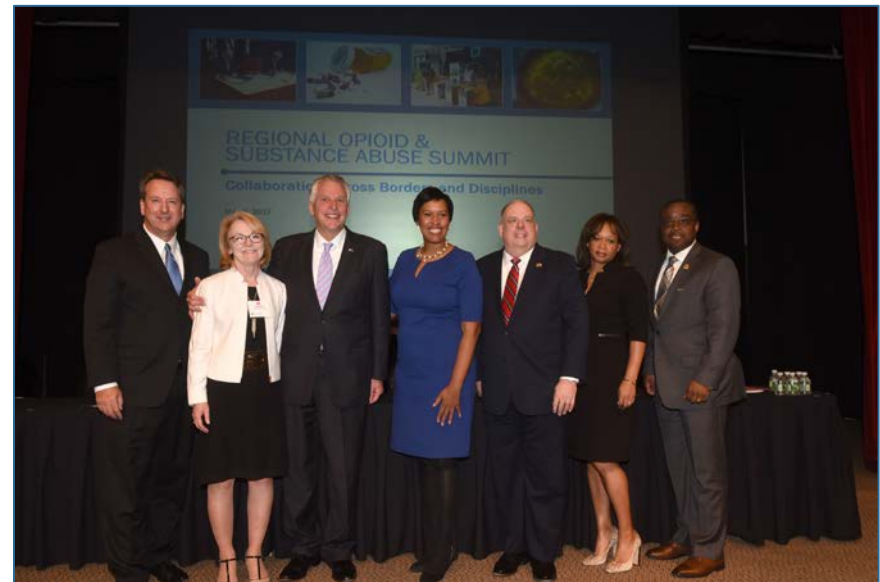
In 2017, COG convened policymakers and public health and safety professionals from across the District, Maryland, and Virginia to address the growing opioid and substance abuse epidemic (COG).