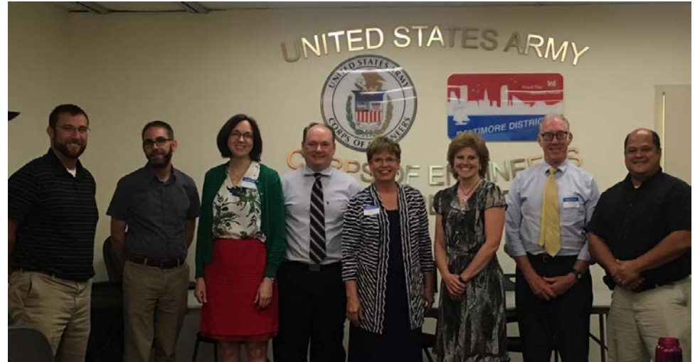
The U.S. Army Corps of Engineers, Baltimore District, signed an agreement in 2017 with COG to begin an approximately $3 million, three-year study on possible ways to address coastal flooding and storm damage across the region. (COG)