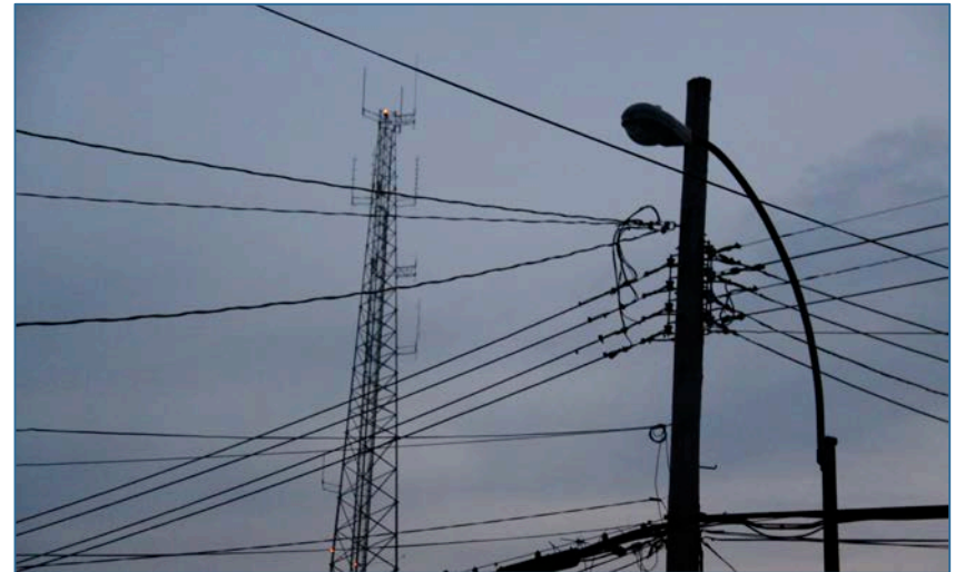
A subscriber radio contract is being finalized for the region's Police and Fire agencies, and could save millions of dollars over the next decade.