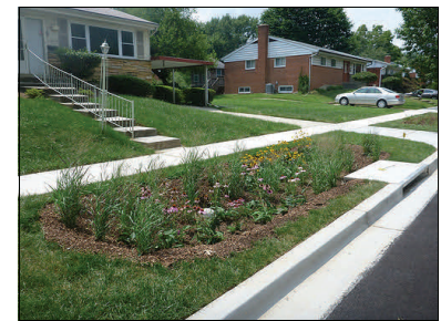
Raingarden: Montgomery Co.