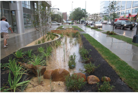
Rain garden: District of Columbia