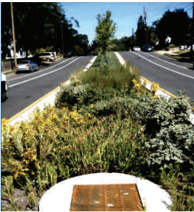
Bioretention: Arlington Co.