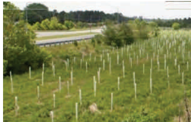
Tree Plantings: MDSHA