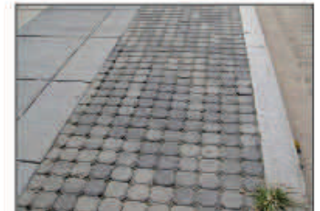
Permeable pavement: District of Columbia