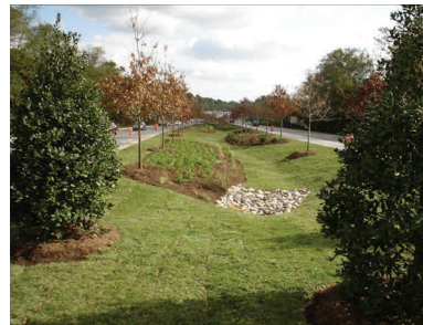
Bioretention in median: Prince George's Co.

Adapted from Water Environment Research Foundation