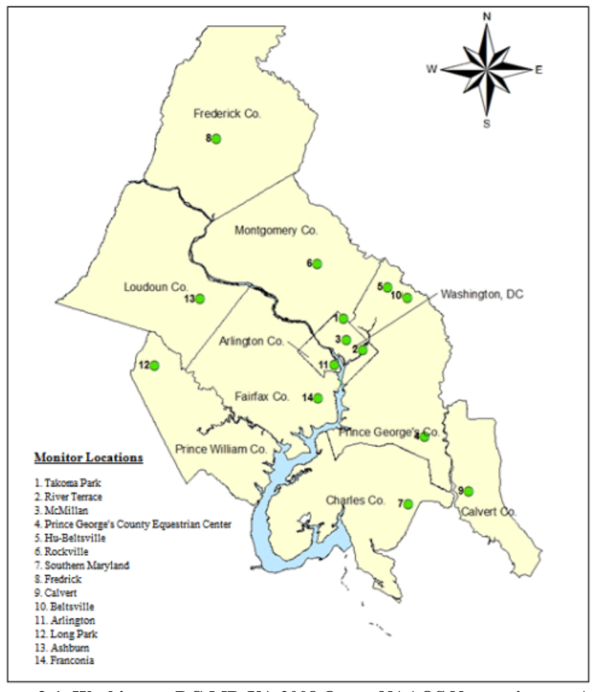
Figure 3-1: Washington DC-MD-VA 2008 Ozone NAAQS Nonattainment Area

As shown in Figure 3-1, the air monitoring network in Washington DC-MD-VA region contains 14 sites that monitor ozone. Federal regulations only mandate four ozone sites for a metropolitan statistical area of greater than 10 million people containing an ozone nonattainment area (40 CFR 58 Appendix D Section 4.1). Therefore, the Washington DC-MD-VA region currently has an exceptionally robust network.