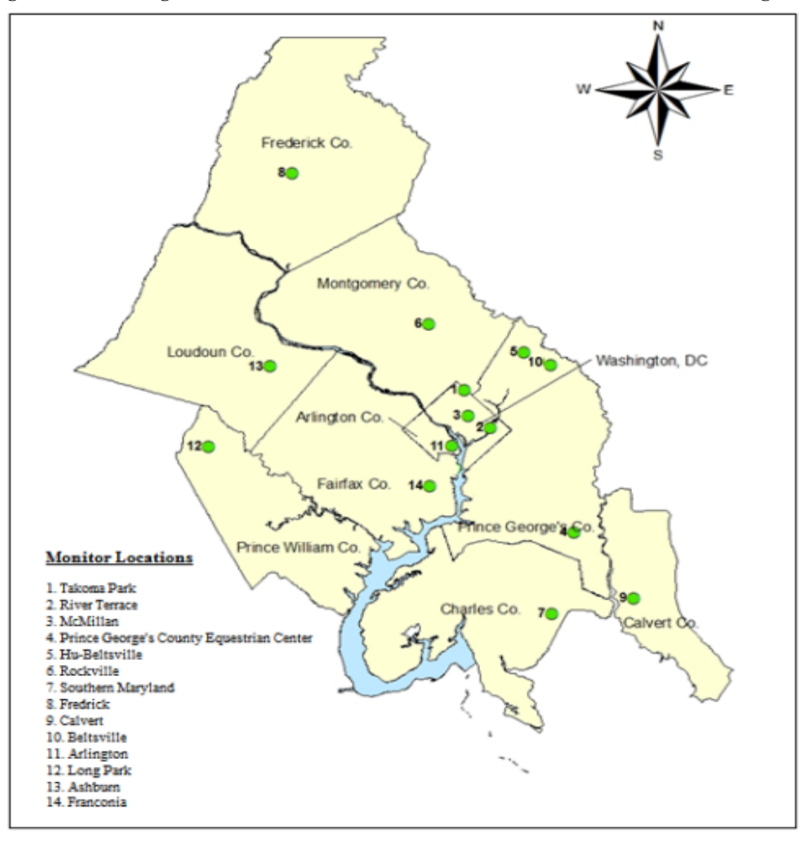
Figure 3-2: Washington DC-MD-VA 2008 Ozone NAAQS Maintenance Area Monitoring Sites

The Washington DC-MD-VA region has been attaining the 2008 ozone NAAQS since 2015, and ozone levels have been continually decreasing over the years. Figure 3-2 shows the ozone monitors currently operating in the maintenance area.