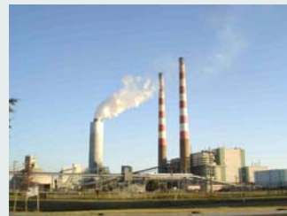
Wet Scrubber Installed at Morgantown Coal Plant - 2009