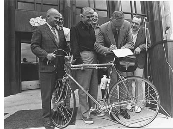
Oregon Governor Tom McCall signs the Bicycle Bill