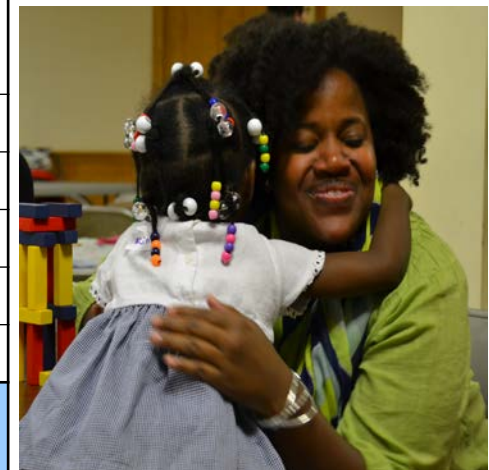
(Homeless Children's Playtime Project)

Children represent 61% of all people in homeless families.