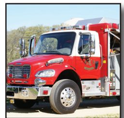
Public Safety & Health