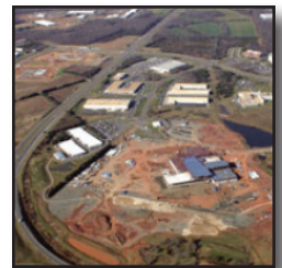
Community Planning & Services