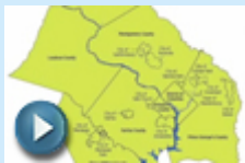
Planning for the Region