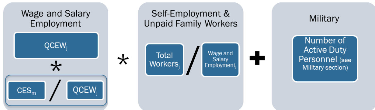
Figure 2 Baseline Employment Method Detailed

Ultimately, to obtain the baseline employment, as outlined in Figure 2, the QCEW is multiplied by the CES Adjustment Factor to produce the total wage and salary employment. Next, the total wage and salary employment is multiplied by the Self-Employment (and Unpaid Family Workers) Adjustment Factor to produce total civilian employment. Finally, military employment is added to obtain total employment.