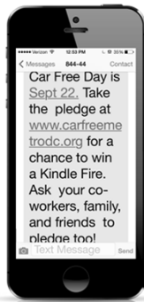
Opt-In Text Messaging