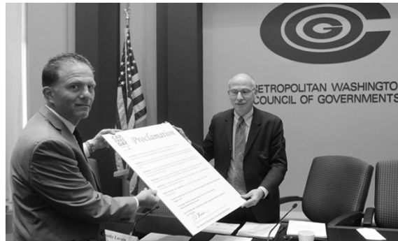
2015 TPB Proclamation Signing