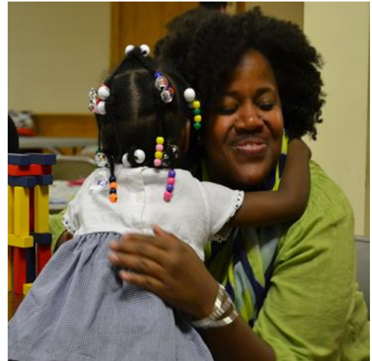
(Homeless Children's Playtime Project)