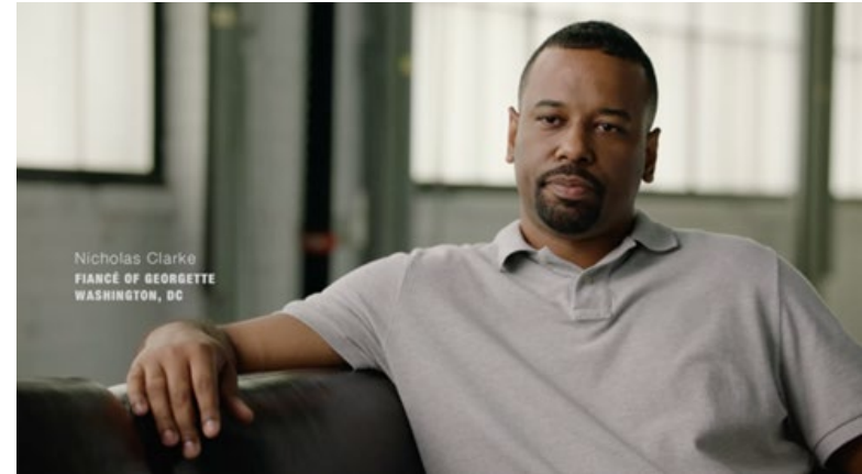
Paid Streaming TV, Internet