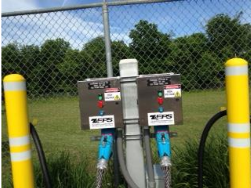
Plug/cord supplied and boxes built by Complete Coach Works

10 Charging Stations installed, with conduit ready for another 10