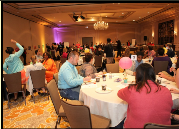
Ballroom at Ritz –Carlton, Pentagon City