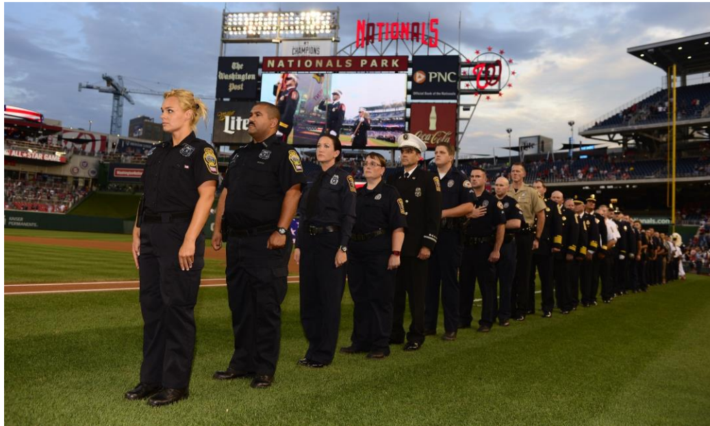
Heroes Day at Nationals Park.