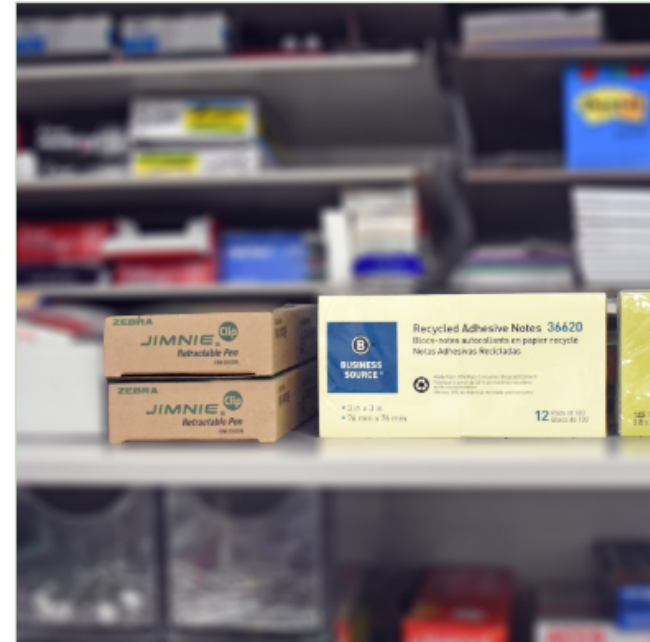
Purchasing 30% post-consumer recycled content paper is now law in California for cities and counties.

https://www.acgov.org/sustain/what/purchasing/sb1383.htm