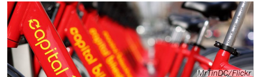
Supporting the expansion of Capital Bikeshare in suburban Activity Centers like Reston in Fairfax County, VA.