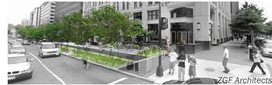
Designing a new streetscape for 19th Street to address land-use and stormwater issues in Downtown DC.