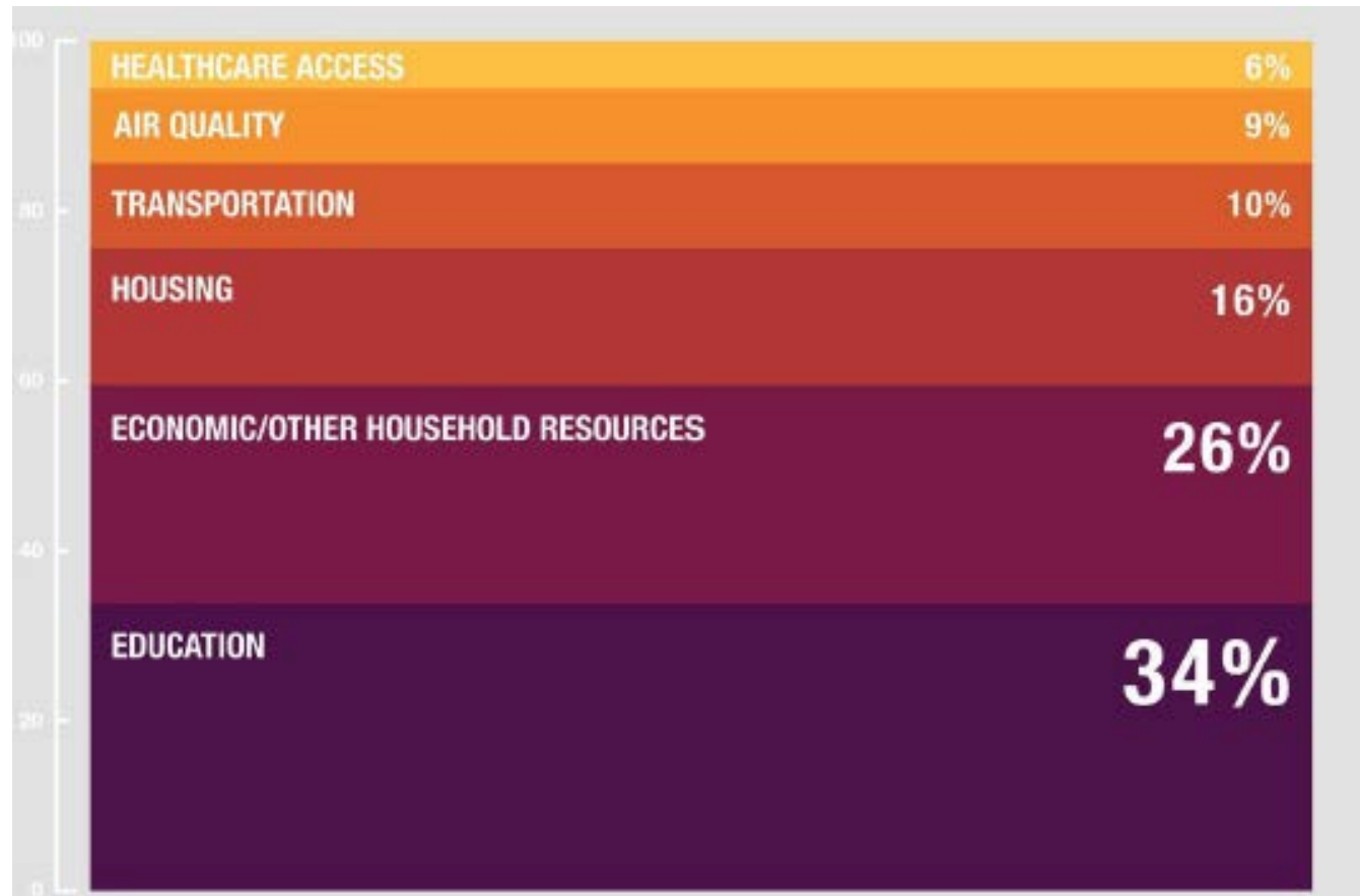
Uneven Opportunities Report: How Conditions for Wellness Vary Across the Metropolitan Washington Region Figure 3. Determinants of life expectancy in the metropolitan Washington region