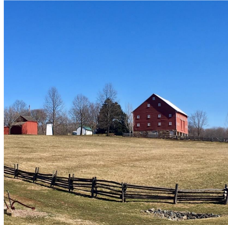
Montgomery County Ag History Farm Park, Derwood, MD.