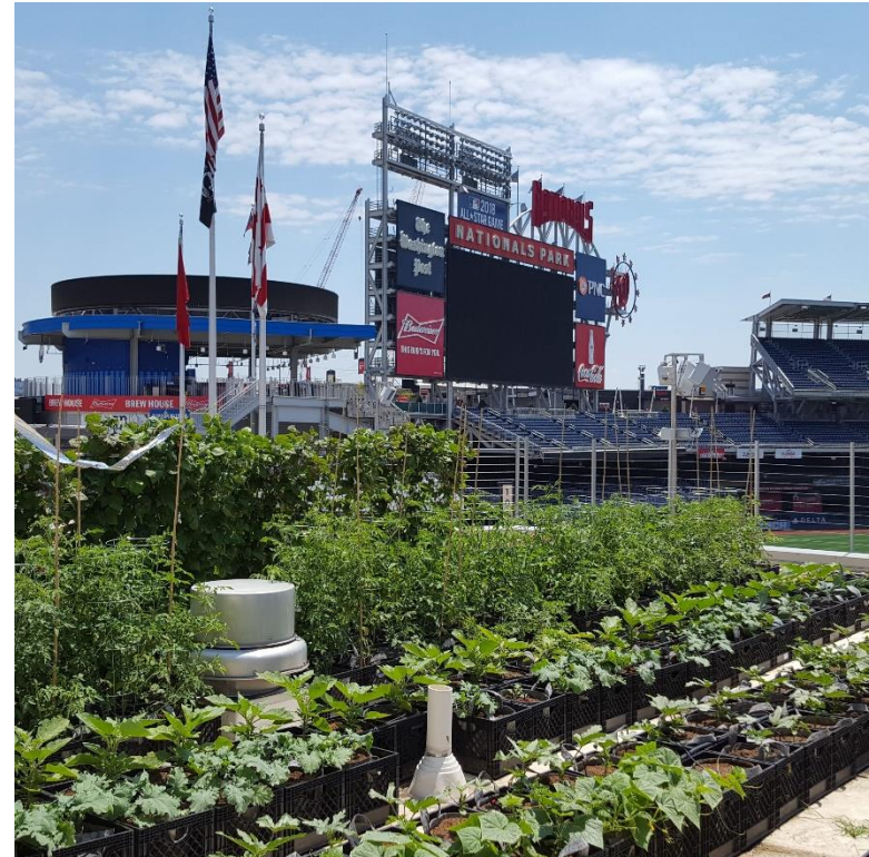
Cultivate the City at Nationals Park 2017