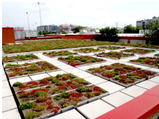
(Above: Green roof in Alexandria, VA)

Several jurisdictions have green building codes or green building policies many of which incorporate green roofs. 41% of jurisdictions have at least one green roof on government property (CEEPC Annual Survey, 2012). Many green roofs have been installed on residential, commercial, and industrial properties throughout the region. No data is available on the prevalence of cool roofs or cool pavements in the region. No jurisdictions or states have cool roof programs or policies that COG is aware of.