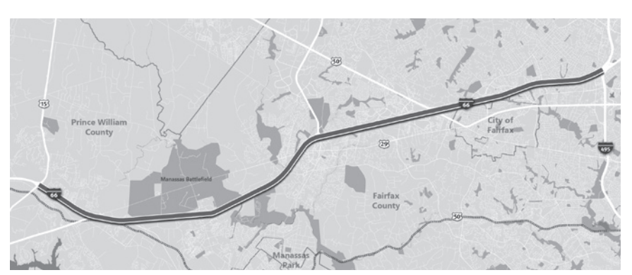
I-66 outside the beltway will be converted to three general purpose lanes and two express lanes with dynamic, congestion-based tolling at all times in both directions by 2022.

At the January 21 TPB meeting, Board discussion focused on learning more