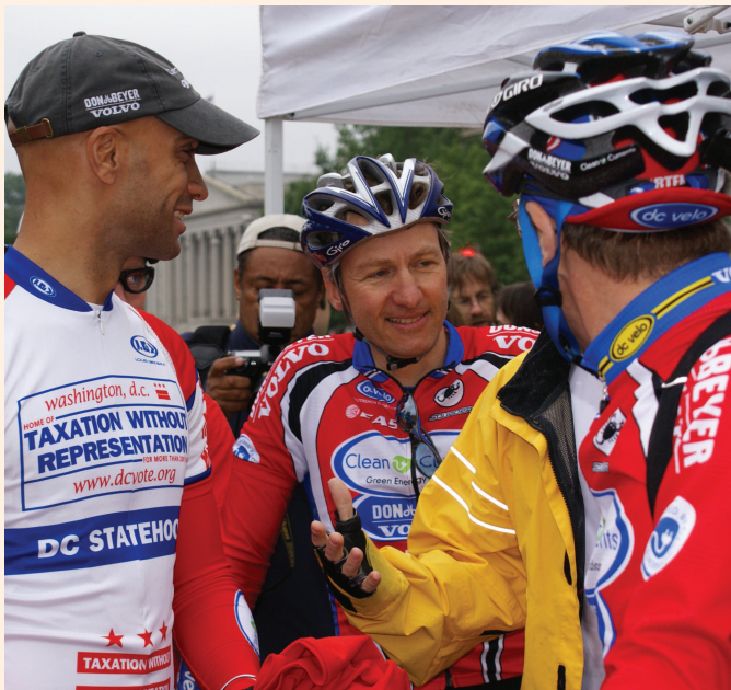
Washington D.C. Mayor Adrian Fenty at the 2007 Bike to Work Day Celebration

Bike to Work Day is an event organized by the Metropolitan Washington Council of Governments Commuter Connections Program and the Washington Area Bicyclists Association (WABA). Reserve your company's space today! Call 800-745-RIDE to reserve your sponsorship for next year as they will go fast!