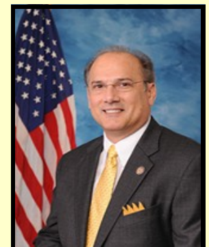
Tom Marino, (R-Penn)