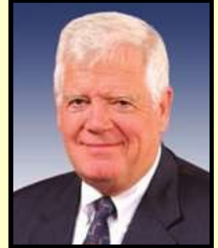
Jim McDermott, (D-Wash)

The bipartisan Congressional Caucus on Foster Youth was founded in 2011. Its co-chairs are comprised of U.S. Representatives Karen Bass (D-California), Jim McDermott (D-Washington), Michele Bachmann (R-Minnesota), and Tom Marino (R-Pennsylvania). The main objective of the Caucus is to highlight the pioneering programs and policies that improve outcomes for children and youth in foster care with a strong emphasis on: safety, permanency, well-being, education opportunities, youth, family, and community engagement. This initiative is to also examine several legislative propositions for example the over-prescribing of psychotropic medications to youth in foster care.