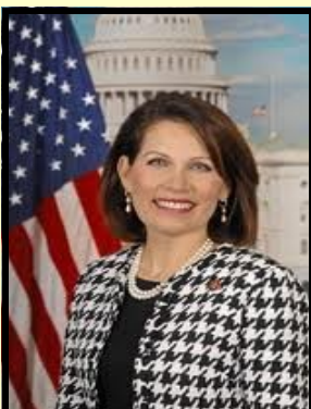
Michele Bachman, (R-Minn)

Representative Bass is a new Member of Congress. She is committed to the ongoing progress to improve child welfare systems on a federal level. Representative Bachmann is a biological mother of five and has fostered 23 children. She stated that the Caucus' mission "happens to be one of my personal goals, to work on bringing stability, support and permanency to the lives of foster youth across the nation." Recently co-chairs Bass and Marino participated in the inaugural Stop of the Listening tour at Los Angeles, California. Followers received an comprehensive perspective of prevention and family unification techniques that have made a difference in safely reducing the number of children in the Los Angeles Foster Care System. In the future, COG could potentially host a Listening Tour for our region too.