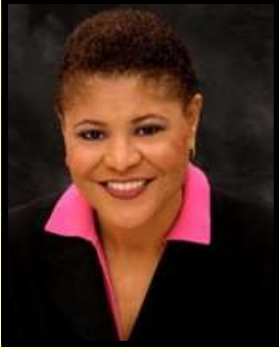
Karen Bass, (D-Calif)