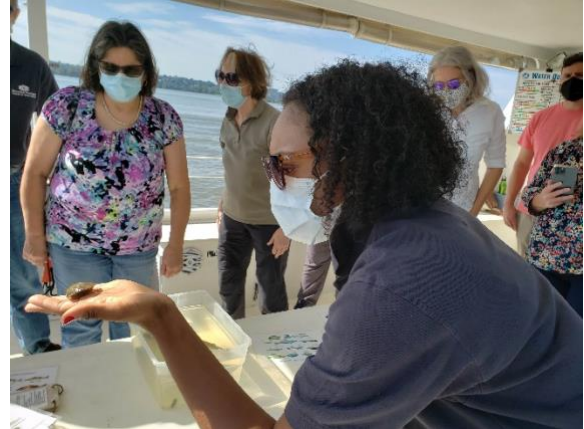
CBPC members tour the Potomac