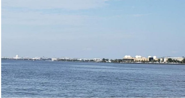
Potomac River

On October 15, eight members of the CBPC went on a Chesapeake Bay Foundation (CBF) tour of the Potomac where they trawled for fish species, compared water quality between the Blue Plains wastewater outfall and the mainstem of the Potomac River, and learned more about Alexandria's investments to reengineer to address their combined sewer overflow issue. CBF also shared their legislative priorities.