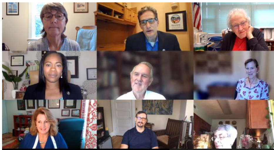
Microsoft Teams screenshot of the forum

On September 17, 2021 the CBPC met with officials from the Environmental Protection Agency (EPA), the State of Maryland, the Commonwealth of Virginia, and the District of Columbia to discuss priorities for water quality, including the need for climate resilience and to double down on Diversity, Equity, and Inclusion (DEI) efforts.