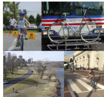
Bicycle and Pedestrian Plan for the National Capital Region