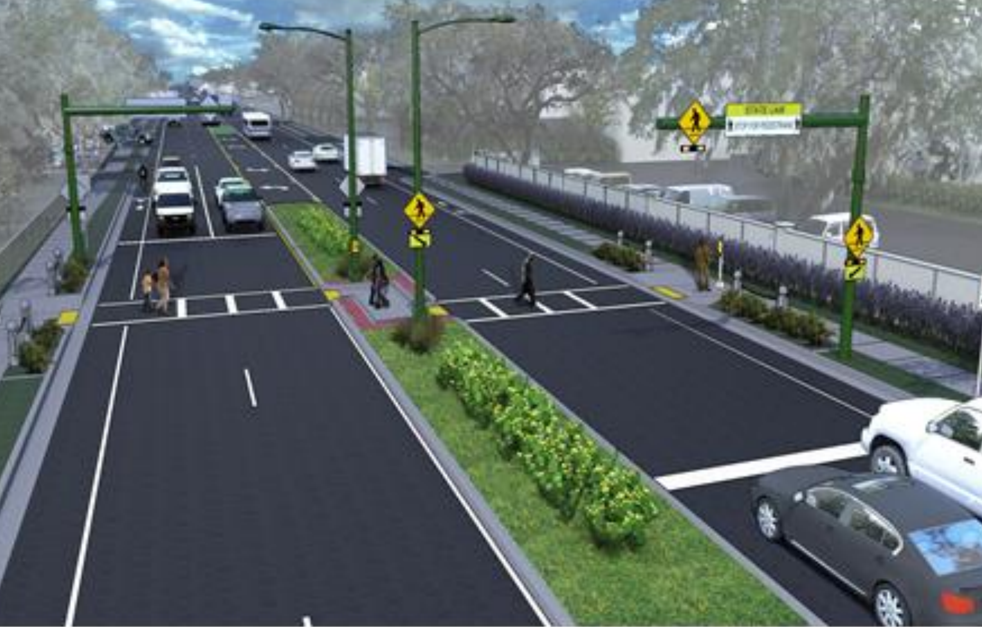
Fletcher Avenue Complete Streets Rendering Groundbreaking Fall 2014