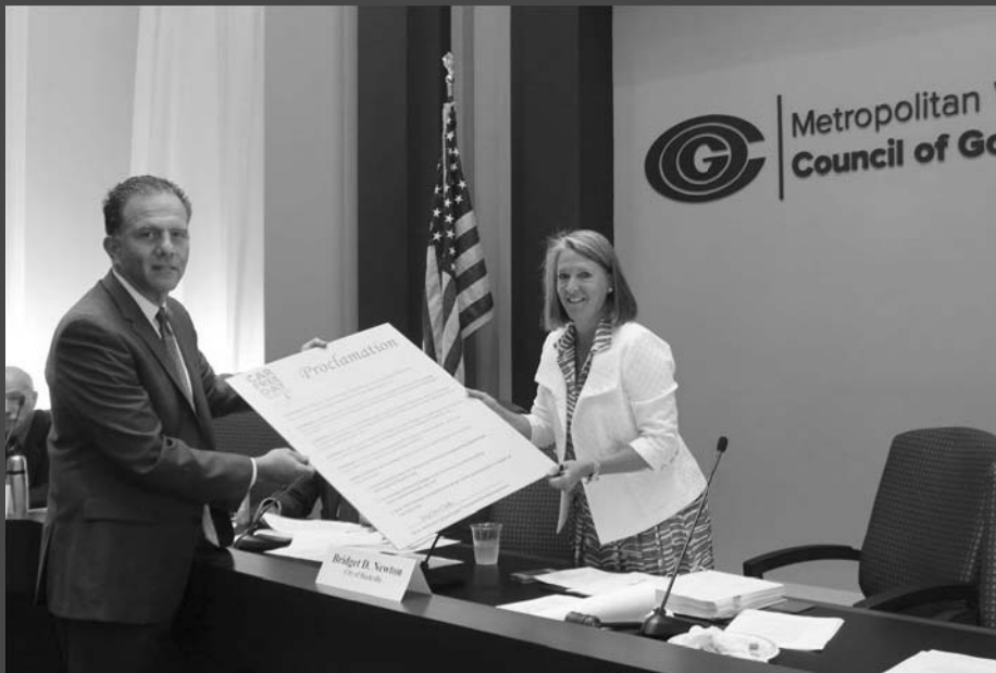
2016 TPB Proclamation Signing