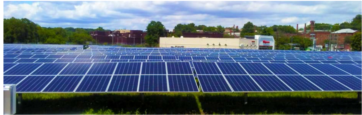
Oxon Run Community Renewable Energy Facility