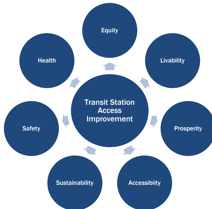
Figure 2: Summary of Impact Areas of HCT Station Area Access Improvements

Moving forward, optimizing HCTs could entail: