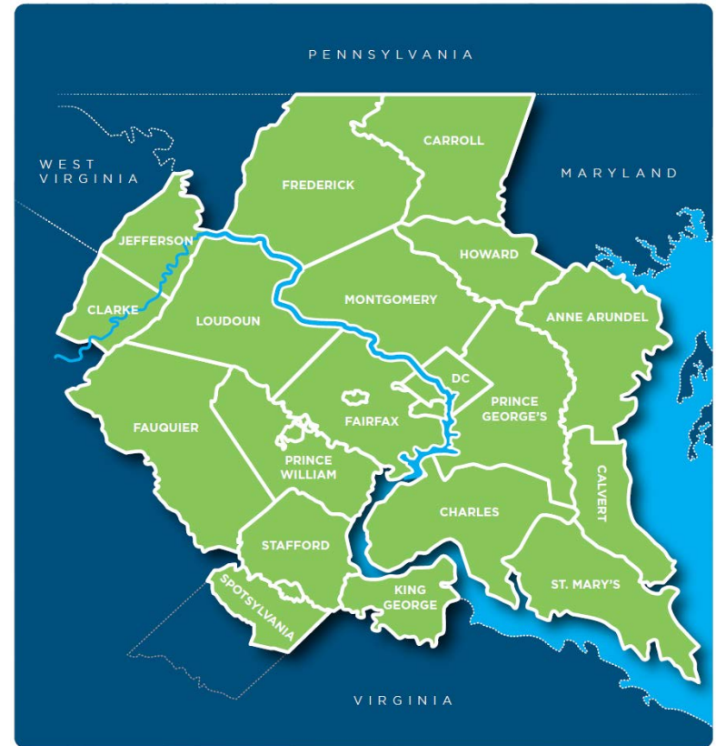
TPB Modeled Area