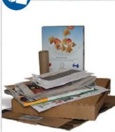
Mixed Paper, Newspaper, Magazines, and Flattened Cardboard