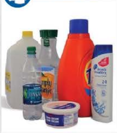
Kitchen, Laundry, Bath: Bottles and Containers empty and replace cap