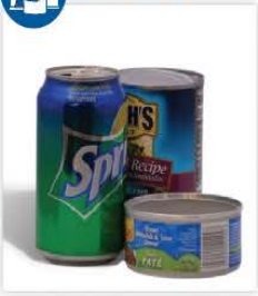
Aluminum and Steel Cans empty and rinse