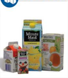
Food and Beverage Cartons empty and rinse