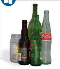
Bottles and Jars empty and rinse