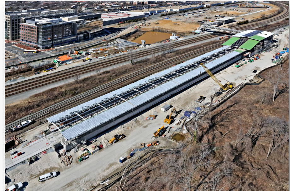
Potomac Yard Station, looking North – as of February 2022