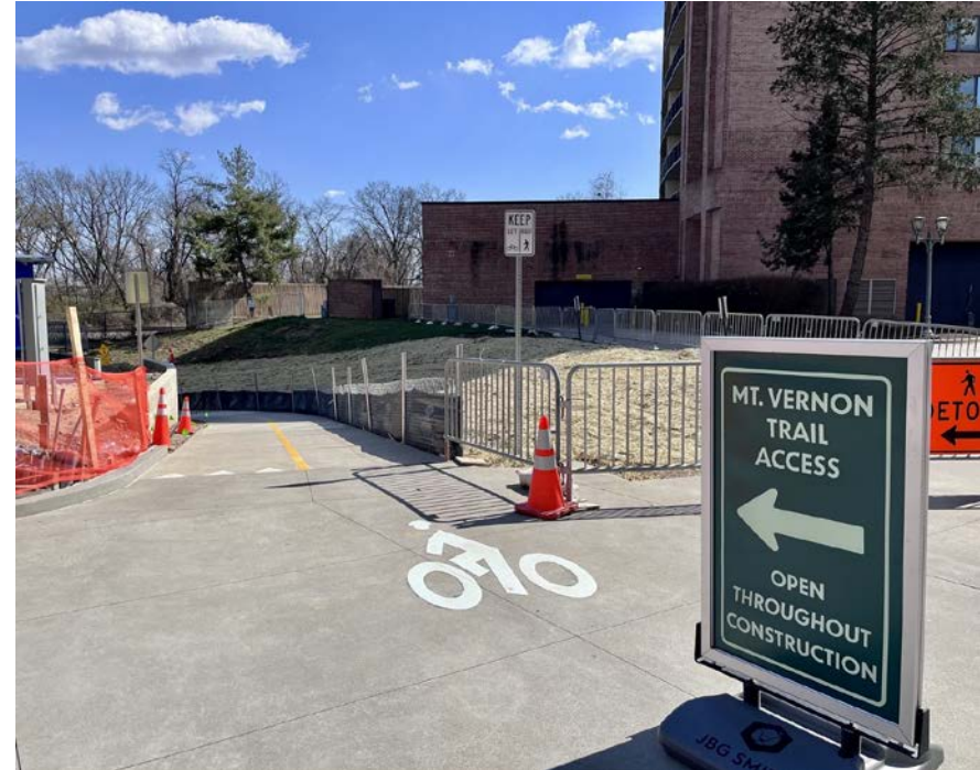
Crystal City access to Mount Vernon Trail, Virginia