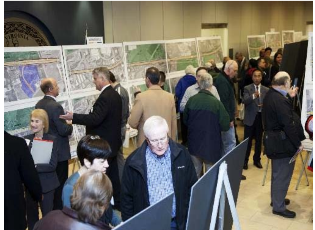
I-66 public meeting