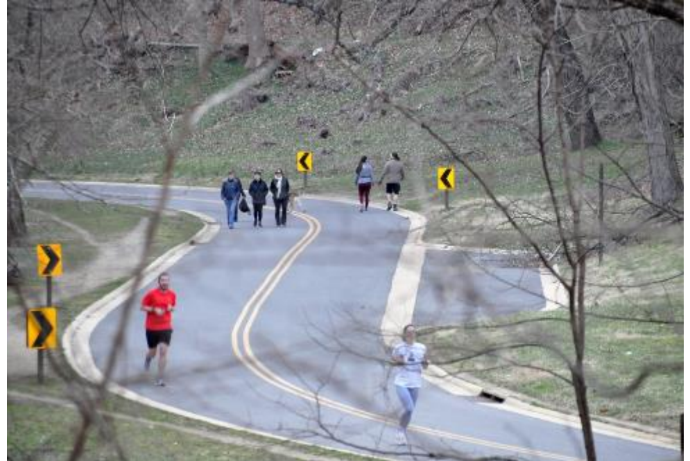
Beach Drive