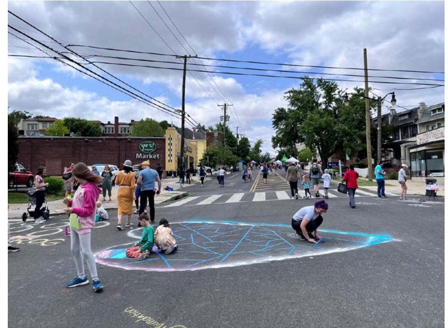
Chalk heart at Brookland open streets, Washington, DC