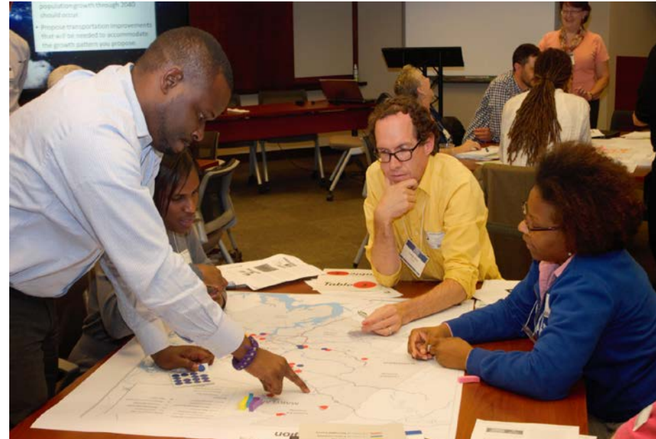
Community Leadership Institute (COG/TPB)